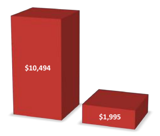
Comparision of WIC FVC Spending in 2016 and 2017

Consequently, the volume of WIC FVC spent on fresh fruits and vegetables at farmers markets in 2017 declined by 81% compared to the year prior.